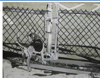
Dog before Fence

cataloging functions and special projects as needed.