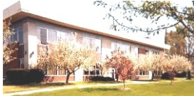
CLARA FRITZSCHE LIBRARY