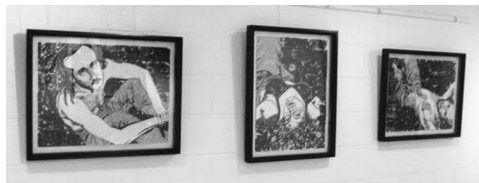
Capstone project: Poe, Austen and Shakespeare strike a pose.

Art Project was planted. First she noticed the design potential in thermal paper used for store receipts, which responds differently to different levels of heat. This observation, coupled with the