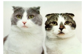
(l-r) Baker and Taylor

discs and digital content (e books and e-Spoken word Audio). It also provides collection development and processing services to libraries throughout the world. The cats' photos appeared in advertisements, and on posters, shopping bags,