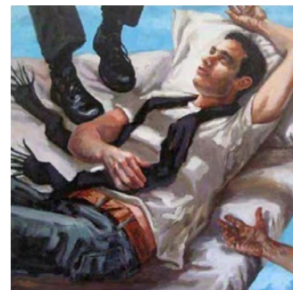
"A Complex Repose"