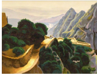
Montserrat in the Pyrenees (Outside of Barcelona)

entitled "Montserrat in the Pyrenees (Outside of Barcelona)" serves as the focal point of the exhibit.