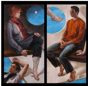
"Trying to Maintain Focus...His and Hers"