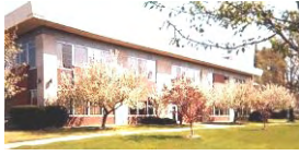
CLARA FRITZSCHE LIBRARY