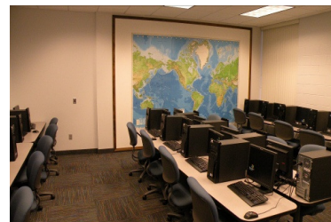
The computer lab in L219

crew of student workers, the library staff was able to move the journals to their new home in time for the opening of the fall semester. The journal stacks are temporarily closed to patrons but it is hoped that soon they can be fully accessible to students, faculty and staff.