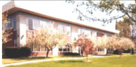
CLARA FRITZSCHE LIBRARY NOTRE DAME COLLEGE